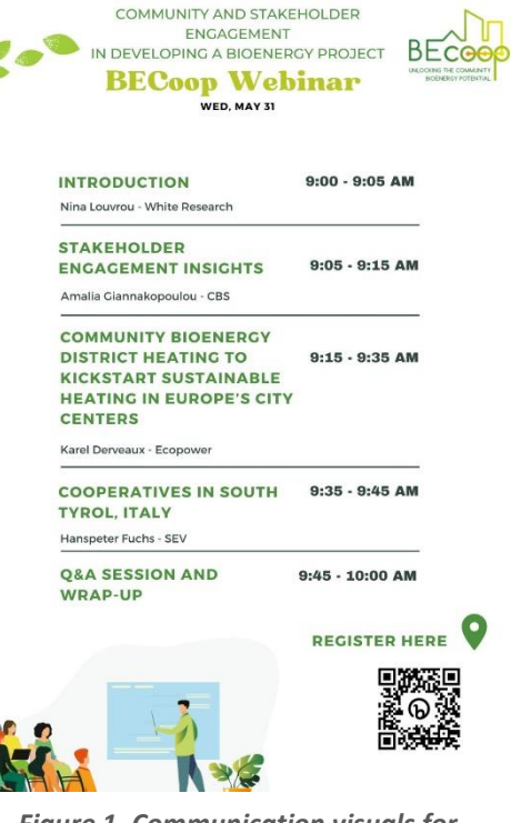
Figure 1. Communication visuals for broadcasting the BECoop webinars